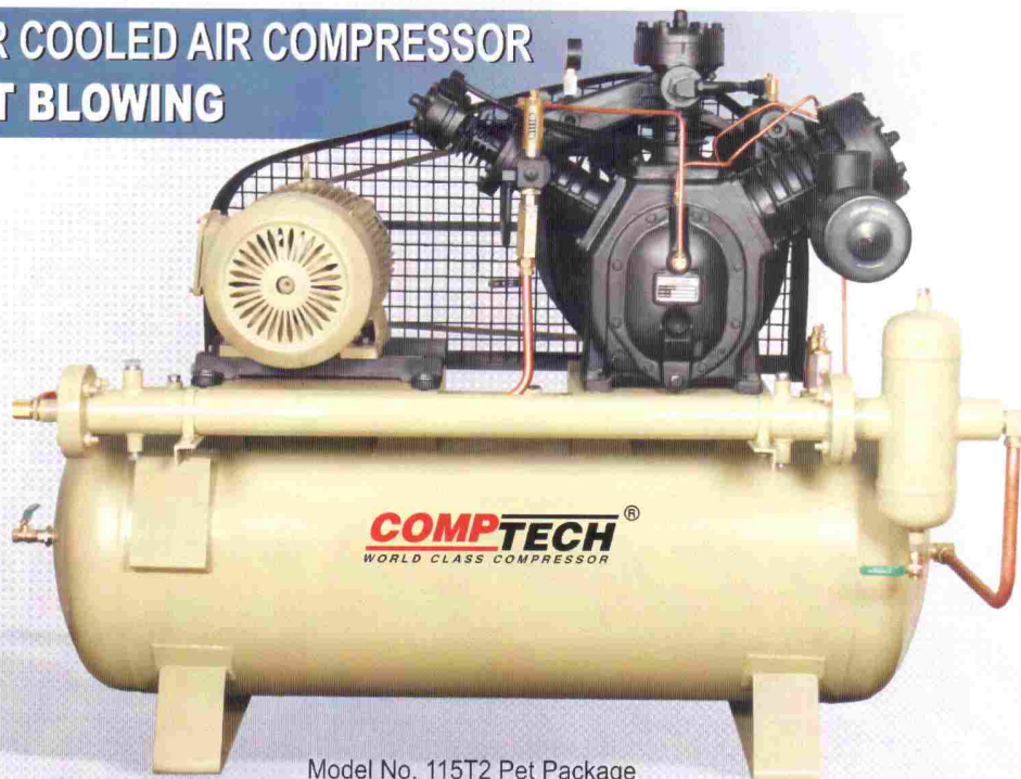
Model No. 115T2 Pet Package