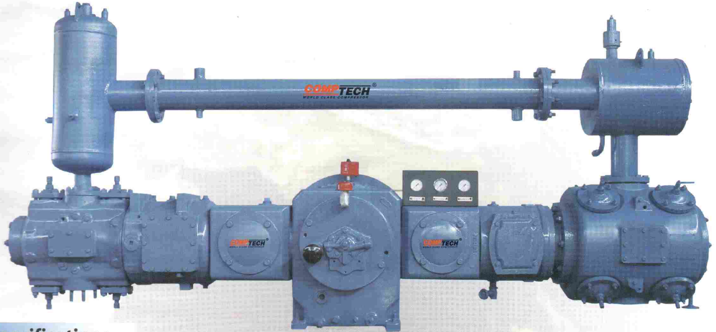
OB Series Compressor